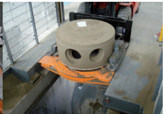
Removal of milled manhole base from the Primuss machine