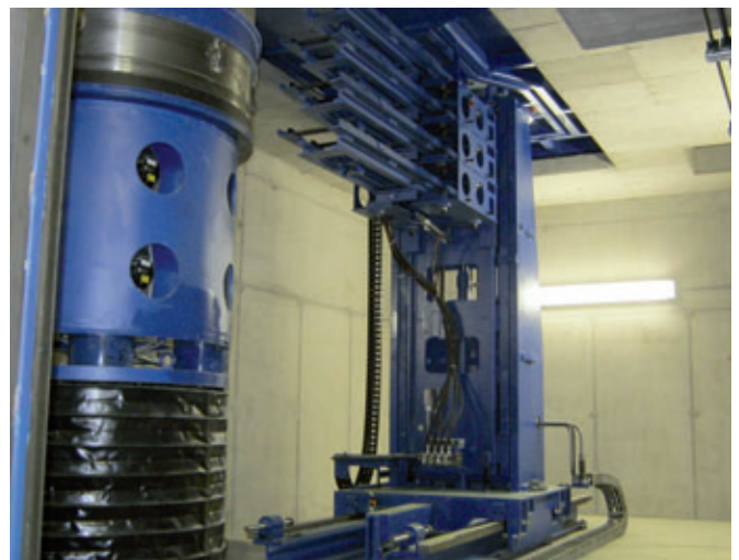
Automatic step magazine for manhole ring and cone production