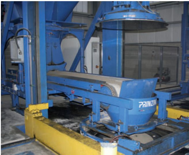
Dosing shutters below the concrete reservoir ensure optimised mould filling