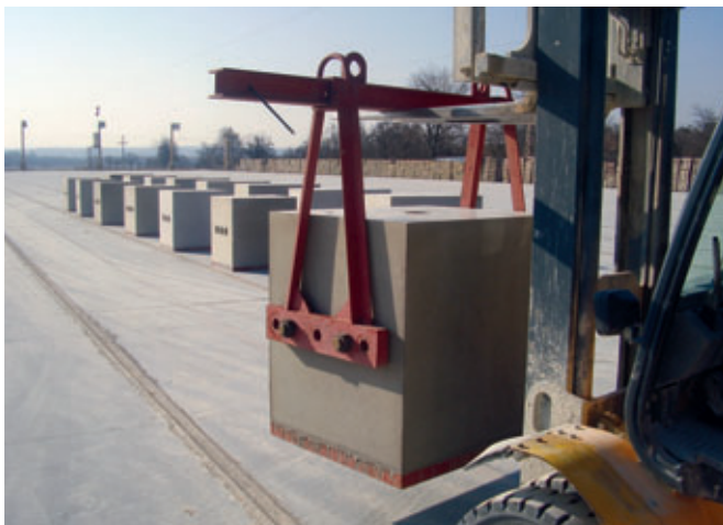
Special components made of SCC – another Dolomit speciality

Although the young company is not yet one of the big players in the Hungarian market,