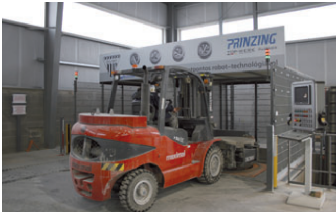
Primuss milling station with two workstations