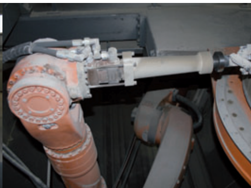
The milled material falls directly into the working pit, from where it is continuously removed by a conveyor.