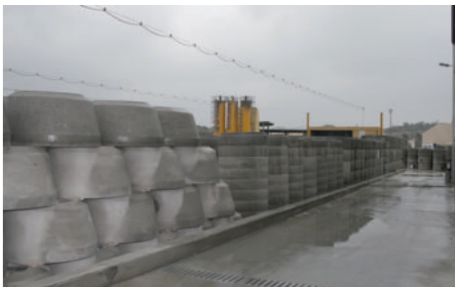
Dolomit now offers the full range of concrete manhole products