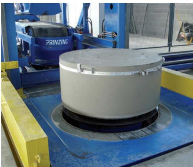
Raw manhole base blank after demoulding. After a short hardening time the blank can be taken to the milling station.

be pushed into the Tornado machine with the pallet inserter. Short mould exchange times enable economic production with frequent dimension changes, while the infinitely variable height adjustment system enables flexible production of manhole elements.