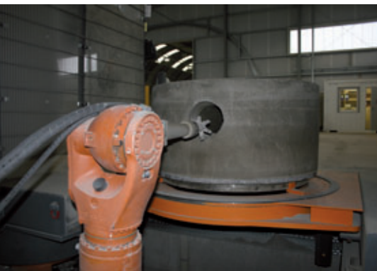
Once a connection has been milled, the robot arm moves back and the manhole is automatically turned to the next milling position.

Prinzing GmbH Anlagentechnik und Formenbau Zum Weißen Jura 3 · 89143 Blaubeuren, Germany T +49 7344 1720 · F +49 7344 17280 info@prinzing-gmbh.de · www.prinzing-gmbh.de www.top-werk.com