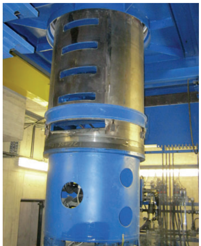
Manhole mould core for direct integration of manhole steps