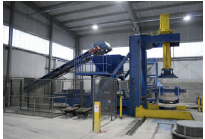
Fully automatic Tornado manhole machine from Prinzing

The base pallets are collected and transferred to the automatic enclosed cleaning station with a forklift truck. The pallets are separated before they pass through the cleaning station. After the cleaning cycle the cleaned pallet is pushed out of the station and replaced with another pallet for cleaning. After the cleaning station the pallets enter the release agent station connected to it, where release agent is applied to the pallets quickly and precisely via a rotating spray mechanism. The pallets prepared in this way can then