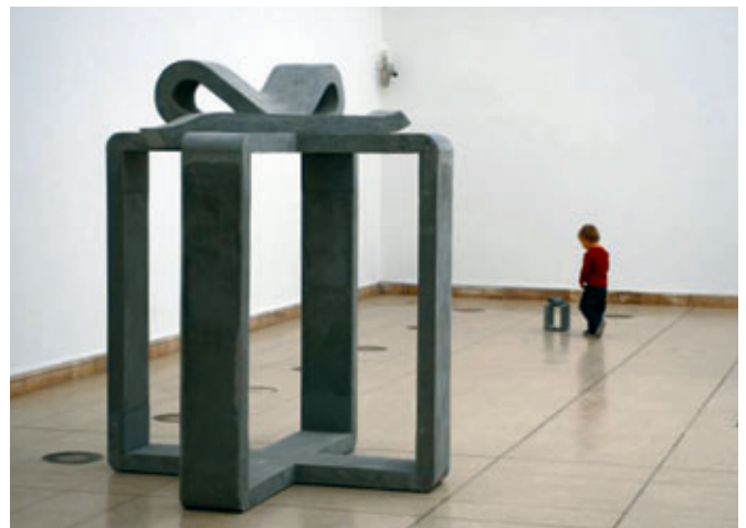
Concrete art – made by Dolomit