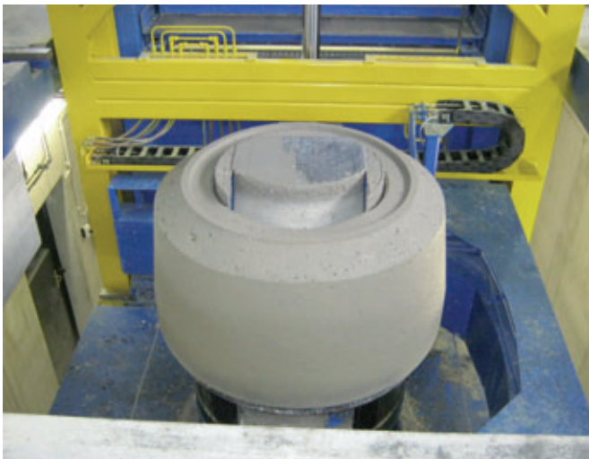
Manhole cone during demoulding in the Tornado machine. Dolomit uses the Tornado to produce the full range of manhole products: cones, rings and bases