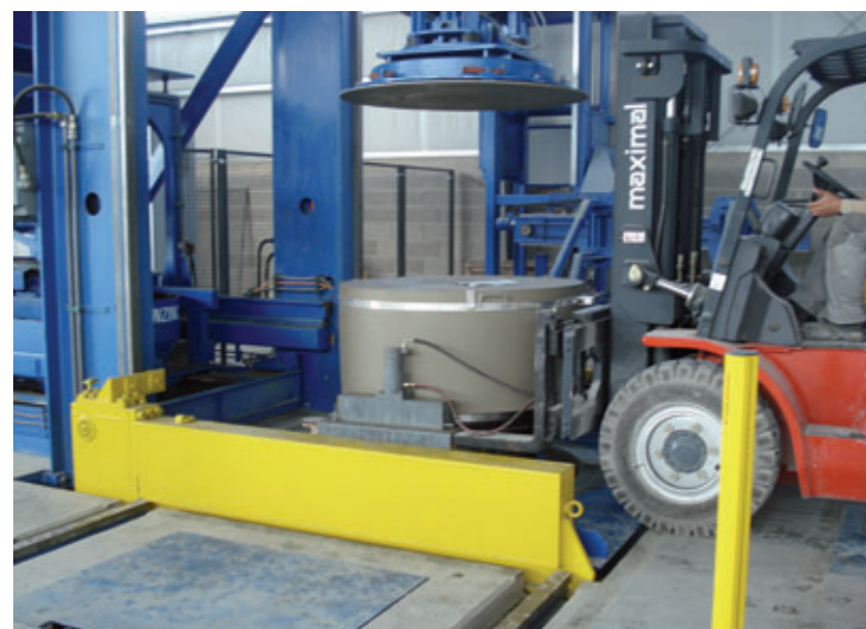
Removal of base blank from the Tornado machine

Depending on the composition of the mixture, the concrete blanks may reach adequate strength after only 60 minutes. The blanks are