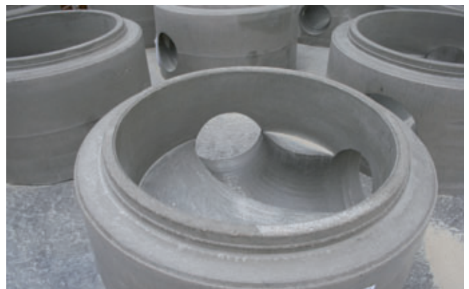
The concrete manhole bases milled with the Primuss method were very popular right from the start